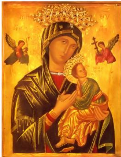
Mother of Perpetual Help Pray for Us