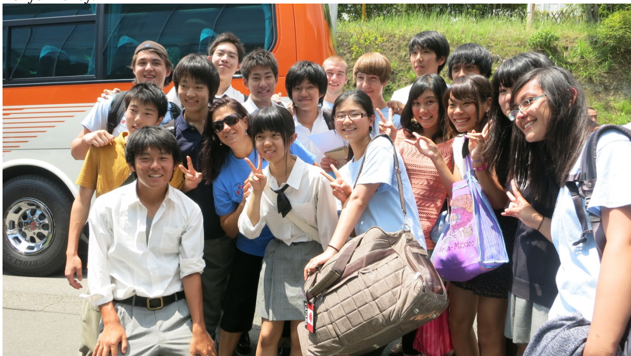
Our final good byes at Yamate High School.