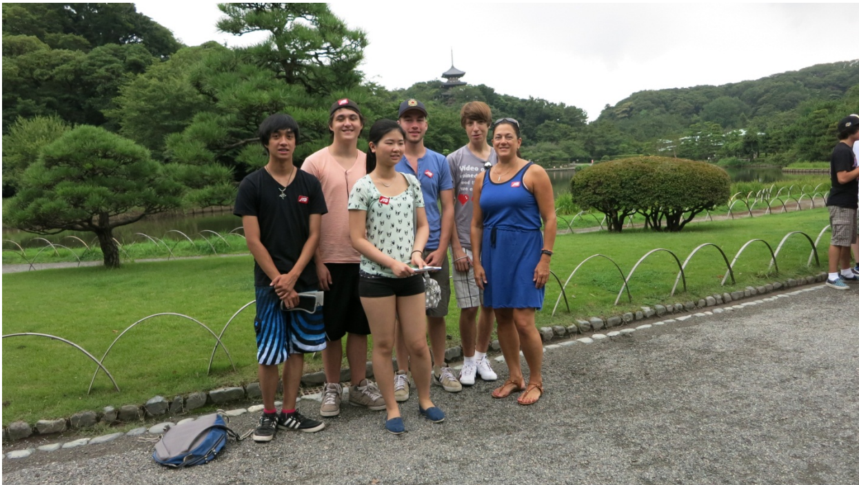
Sankeien Gardens, Yokohama.