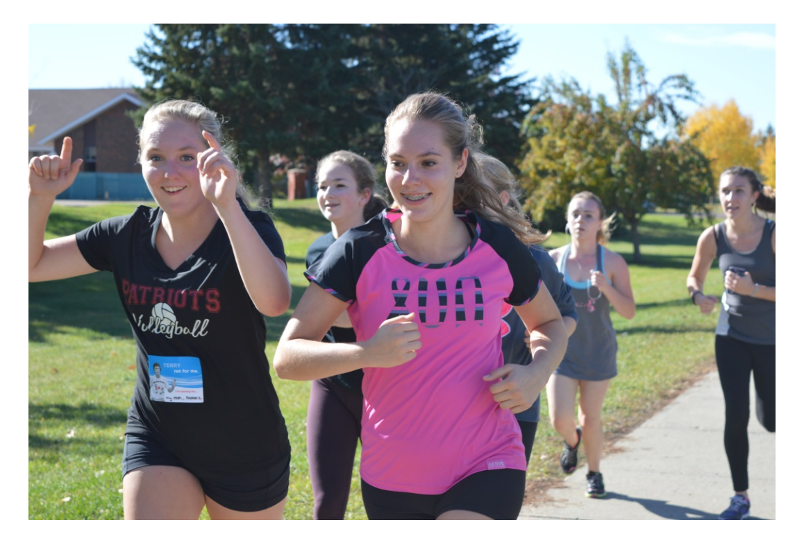
It was a grand day for our Terry Fox run on September 30. Students enjoyed running, or walking and chatting while raising funds for cancer research.